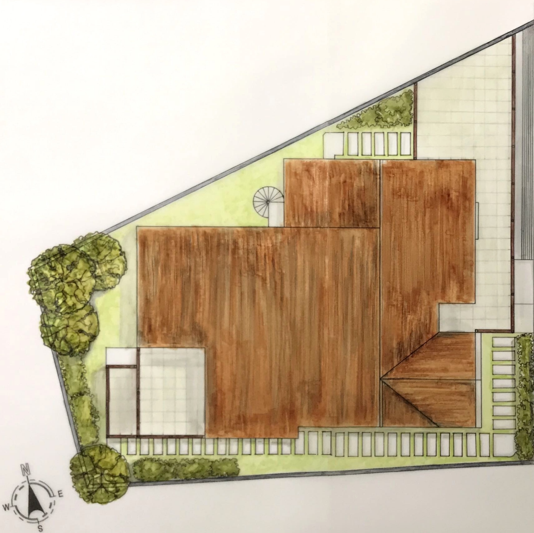
○ SITE DEVELOPMENT PLAN SCALE 1:100 M.