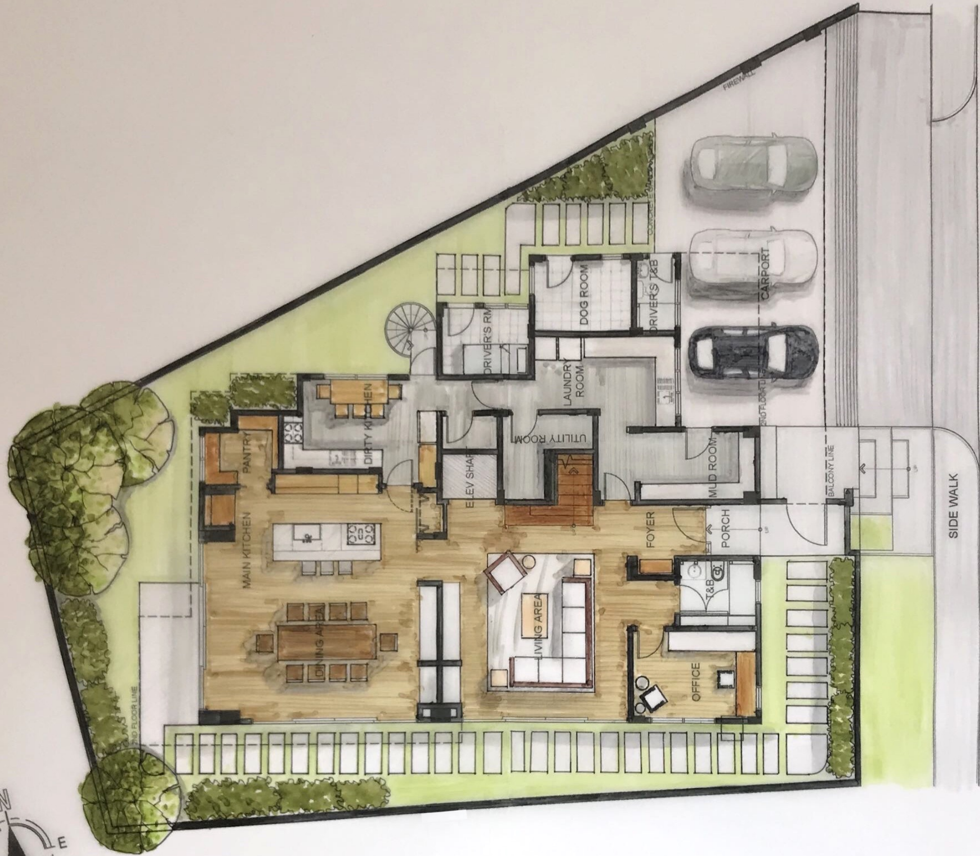
GROUND FLOOR PLAN SCALE 1:100 M.