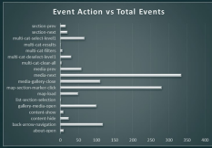
CyberWalk Map Event Action vs Total Events