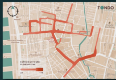
Map of the CyberWalk Participants' Path Flow/Volume

PARTICIPANTS' BIGGEST DISCOVERY Tondo is actually histo-culturally rich in narratives and spaces.