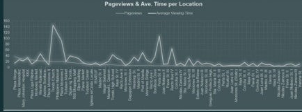
Chart of Pageviews & Ave. Viewing Time per Map Location